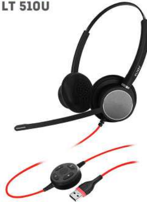
LT-510DU UC OPTIMISED