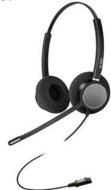
LT-510DP QD HEADSET