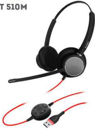
LT-510DM MS TEAMS OPTIMISED