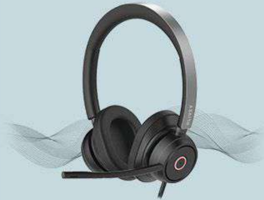
Environment Noise Cancelling Technology