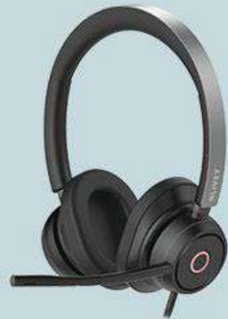
Ergonomic Design for all day wearing comfort!