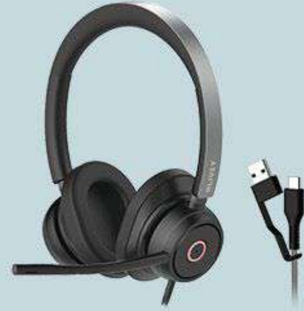
Intelligent Audio, With Advanced Directional Audio sensors